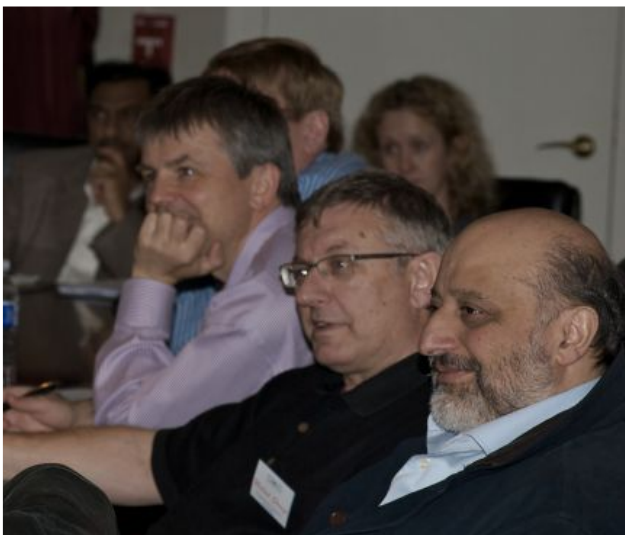
April TSPIN Event Attendees